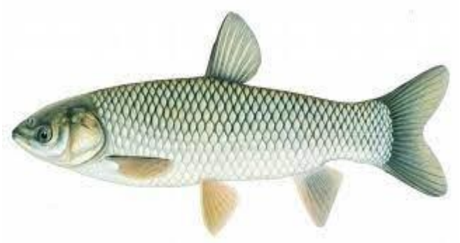
Figure 2. Amur Cup

Crayfish - This fish feeds on zooplankton organisms that occur naturally in ponds. Because these fish are intensively or polythenefed, their numbers in the pond are very high. Therefore, these fish are fed by artificially prepared mixed feed. Currently, in Uzbekistan, for intensive feeding of this fish, various compound feeds are imported from other countries. The fat content of fish is very high due to the high content of various vitamins and proteins in the feed. The grass carp is a reed, a lux that grows naturally in ponds (Figure 2). Reeds and lux contain almost no protein and more fiber. Therefore, it is now a tradition in the Republic to feed this fish with alfalfa in intensive feeding. if not discarded, it will reduce the amount of oxygen in the water.