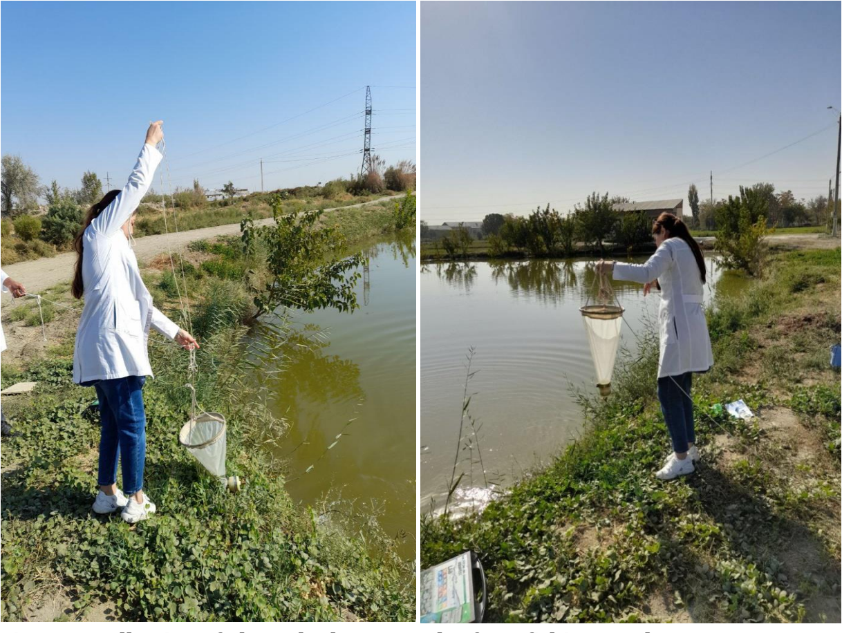
Figure 2. Collection of phytoplankton samples from fishing ponds

Since the fishing ponds of Bukhorobalik LLC were formed using the waters of the Central Collector and canals, the water contains a large amount of biogenic elements. As a result, phytoplankton causes rapid reproduction of organisms.