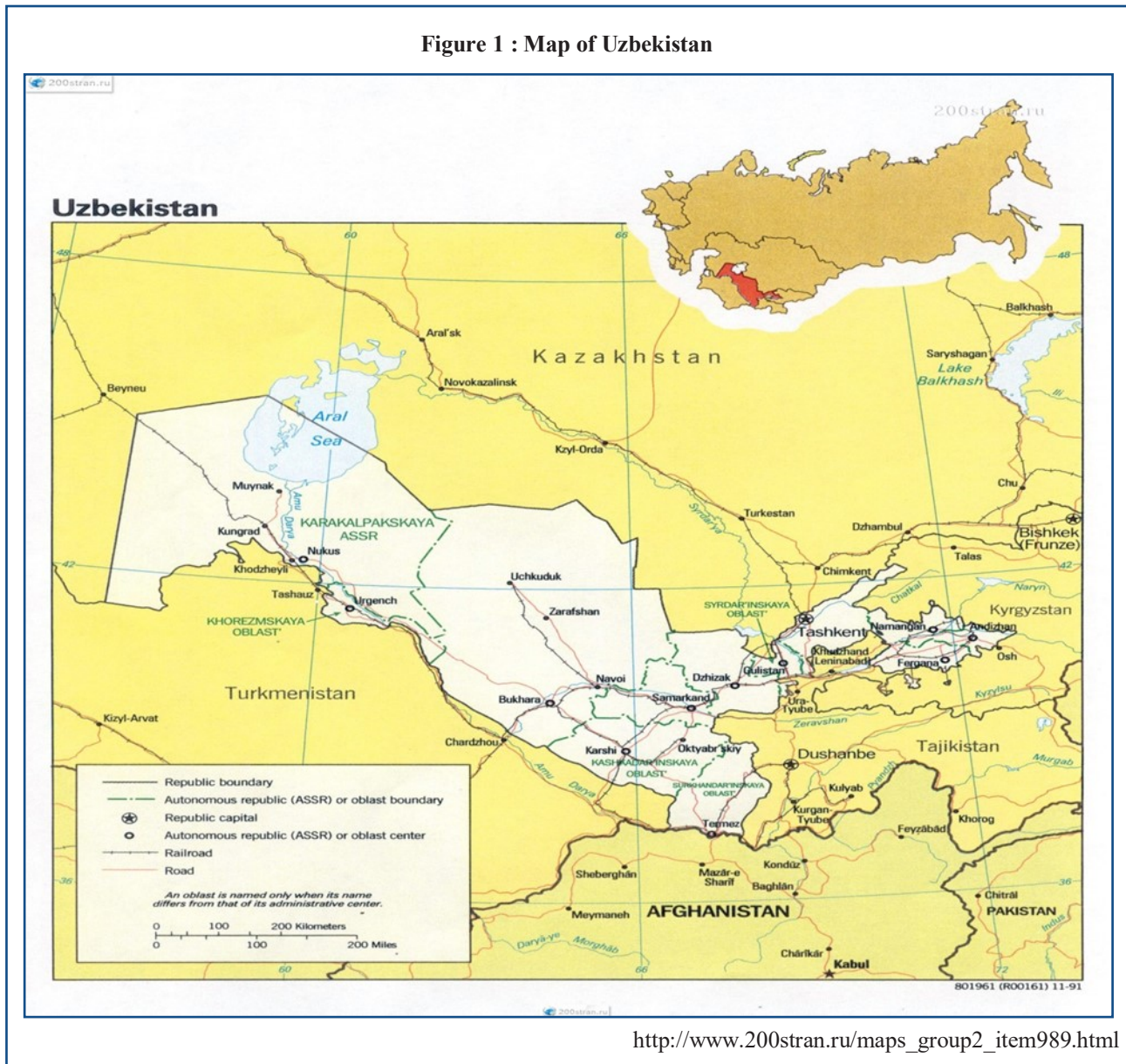
Figure 1 : Map of Uzbekistan