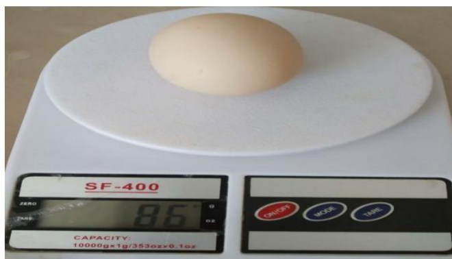
Egg weight 86 g, length 9 cm and circumference 15 cm.

According to our experiments, an increase in egg production and an improvement in weight gain was determined after the abundant addition of Chlorella and Duckweed algae to the food and water of chickens, also with frequent addition of chlorella to porridge from vegetable peel and bread, egg production improved, even one chicken began to lay an egg weighing 86 g with two yolks. Now the chickens are laying every day. A chicken laying an egg with two yolks is laid every other day. [6]