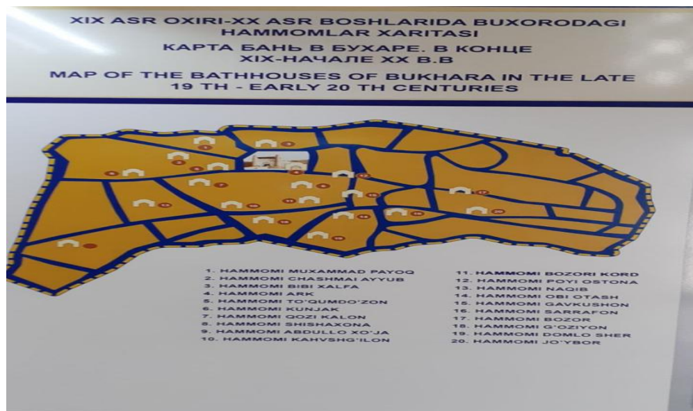
Figure 6. Late XIX - early centuries XX Map of baths in Bukhara.

Various utensils used in the previous period add to the beauty of the museum. In addition, the map of the baths in Bukhara in the late XIX and early XX centuries is reflected (Fig. 6). Baths are one of the proud places of Bukhara. At the beginning of the XX century in Bukhara there were 20 baths. Most of these baths were built in the XVI-XVII centuries and have not changed their shape. Bukhara baths are a unique place for residents and traders and visitors. The baths were built on the ground, and over the years and centuries, more than half of them have remained underground. The baths were operated in exchange for well water. These structures are similar in construction and differ from each other only in the number of rooms.