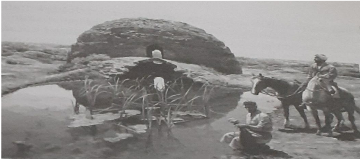
Figure 7. Sardoba.

This explains the need to have two or three raised forts under each cistern. In the spring, when the snow begins to melt, all the surrounding water flows towards the cistern and passes through its holes. That's why they tried to build such basins on steep slopes.