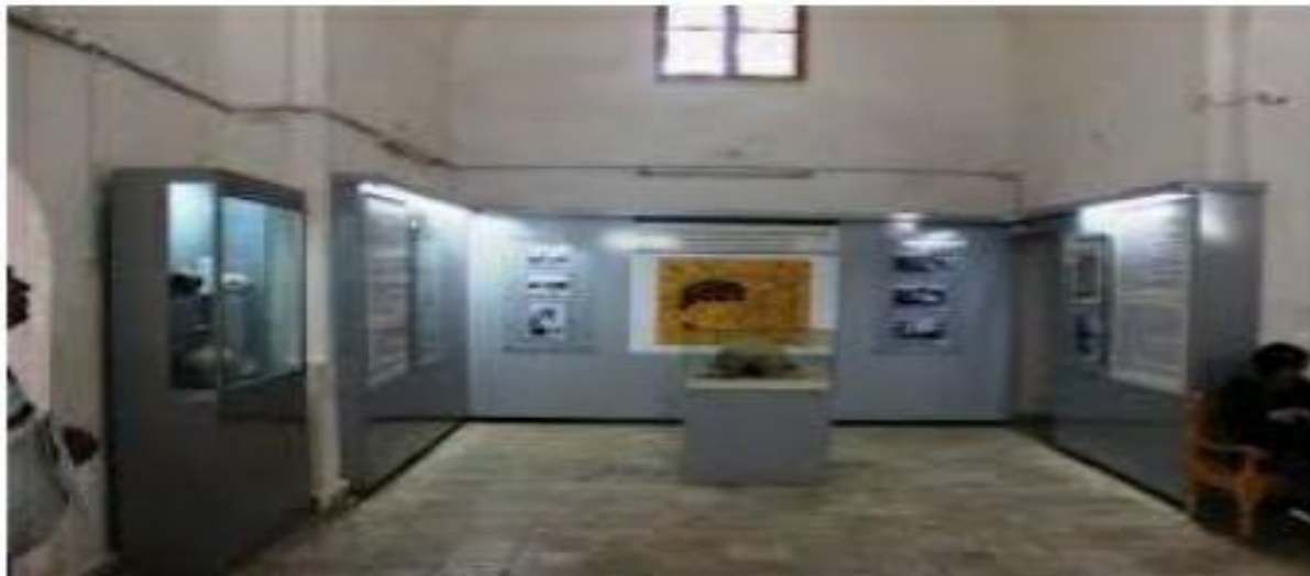
Figure 3. Interior of Chashmai Ayub Water Supply Museum.

Legend has it that this room was built by Arslankhan at the same time as the Minaret Kalon and the Mosque of Prayer. On both sides of it there was a mountain room (4.5x4.5 m) with two doors for pilgrims, which served as a roof. On the wall of the shrine with a double dome and a front roof, according to the order of Amir Temur, in 1379 it was written that a large room with a domed dome and a corridor with towers in the corners were built. The old part of the building remained inside.