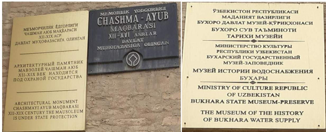
Figure 1. The spring is a unique monument of Ayub-Bukhara

Brief classification of Chashmai Ayub water supply museum. The fountain of Job is sometimes called the tomb, in fact it is the place where Job walked. Apparently, the veneration of the prophet Job originated in pre-Islamic times in connection with the worship of water. The construction of the building will take several stages.