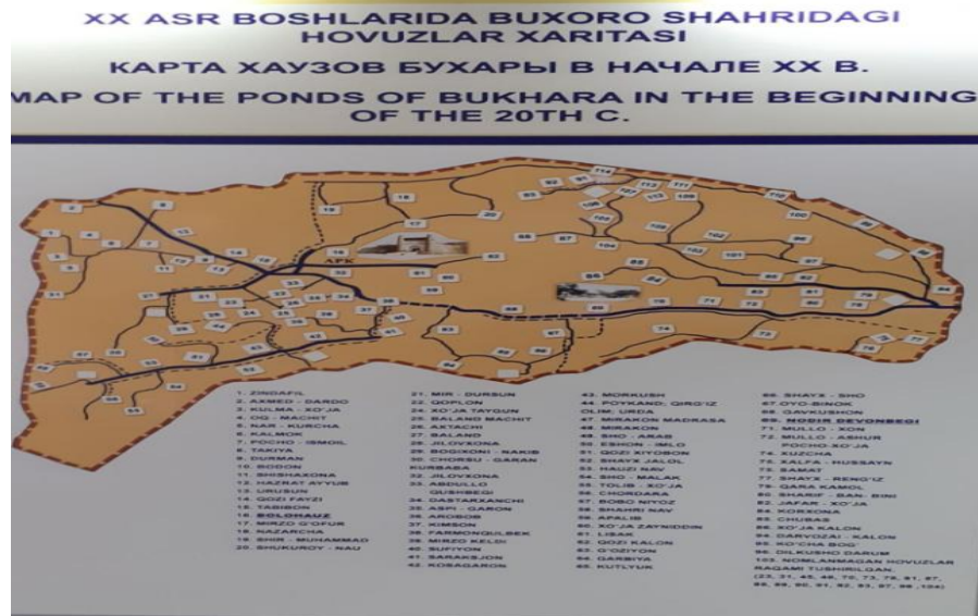
Figure 5. Bukhara in the early twentieth century map of pools in the city.

Various utensils used in the previous period add to the beauty of the museum. In addition, the map of the baths in Bukhara in the late XIX and early XX centuries is reflected (Fig. 6). Baths are one of the proud places of Bukhara. At the beginning of the XX century in Bukhara there were 20 baths. Most of these baths were built in the XVI-XVII centuries and have not changed their shape. Bukhara baths are a unique place for residents and traders and visitors. The baths were built on the ground, and over the years and centuries, more than half of them have remained underground. The baths were operated in exchange for well water. These structures are similar in construction and differ from each other only in the number of rooms.