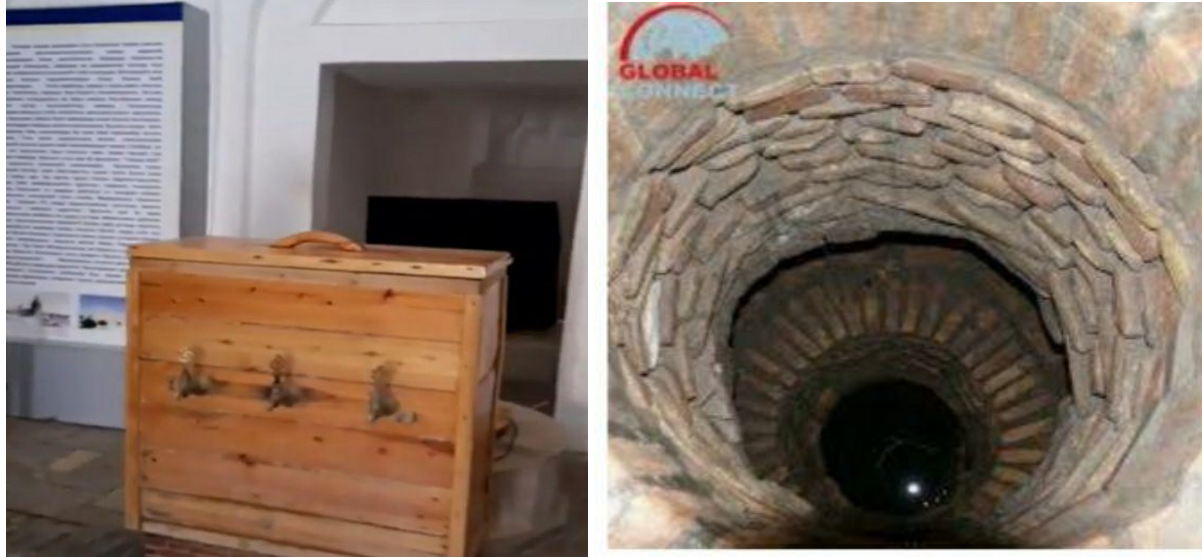
Figure 3. Chashmai Job well.

Legend has it that this room was built by Arslankhan at the same time as the Minaret Kalon and the Mosque of Prayer. On both sides of it there was a mountain room (4.5x4.5 m) with two doors for pilgrims, which served as a roof. On the wall of the shrine with a double dome and a front roof, according to the order of Amir Temur, in 1379 it was written that a large room with a domed dome and a corridor with towers in the corners were built. The old part of the building remained inside.