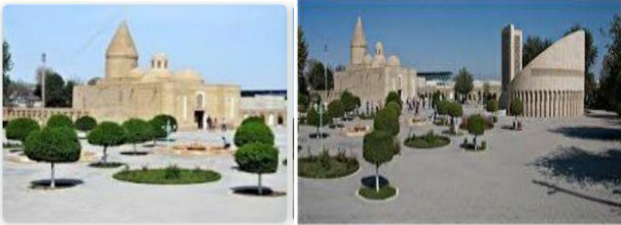
Figure 2. Exterior of Chashmai Ayub Water Supply Museum

It is believed that its ancient part dates back to the XII century. At the same time, the date 1380 or 1384/5 is engraved on the surviving tombstone (which caused the inscription to be read differently because it was not well preserved) - this is the reign of Amir Temur, and later appeared the roof, dated 16th century. The building has six rooms, inside of which there is a sacred spring, behind which there is a large altar mosque.