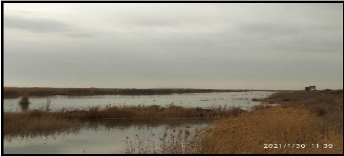
Figure 6. Lakes formed as a result of rising groundwater levels.

large area around the road near the lake is covered with salt.