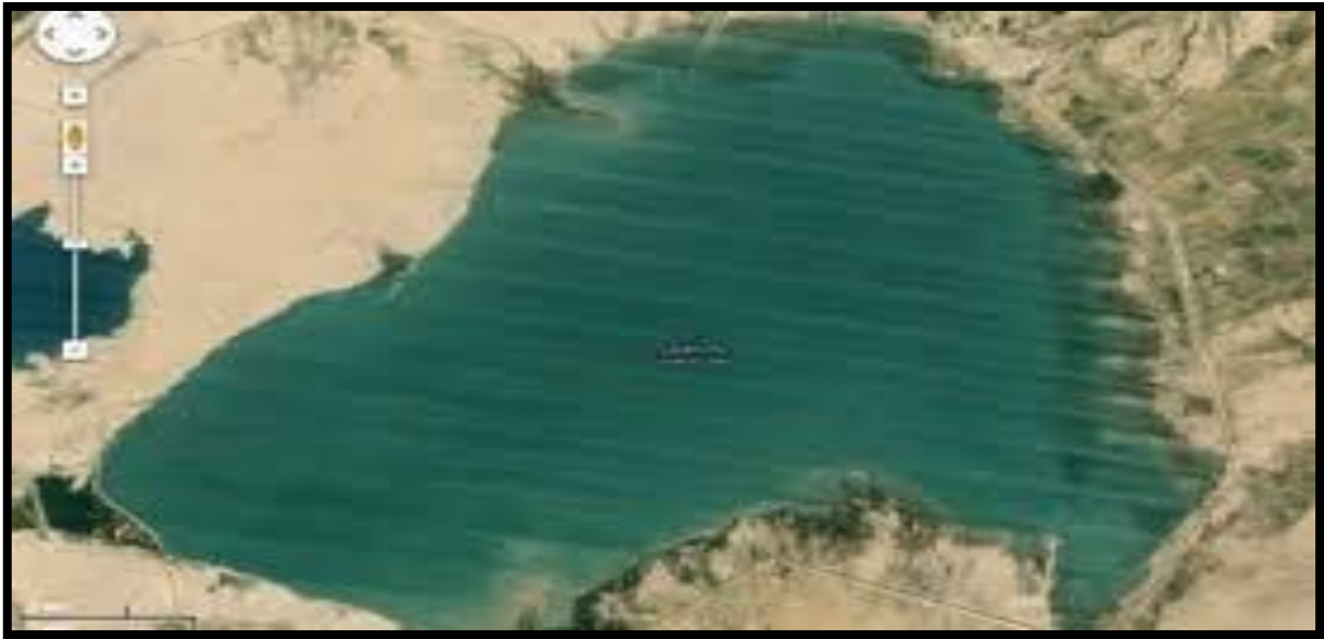
Figure 1. Aerial view of the Todakol Reservoir

Figure 1 is a space image of the Todakol Reservoir. It describes the exact shape of the reservoir, the area around it and the geographical location. The geographical location of the reservoir is 39°05'11" north latitude and 64°05'11" east longitude. The reservoir will be filled with water through the Amu-Bukhara canal. The natural geographical location of the dam is located in the Lower Zarafshan natural geographical district, east of the ancient Bukhara delta. Different sources (1952, 1968, 1973, 1983) give different information about the initial commissioning of the reservoir. The Zarafshan valley is located in the central part of Central Asia between Turkestan, Aktau and Zarafshan ridges. The eastern mountainous part of the valley belongs to Tajikistan, the western foothills and plains to the territory of Uzbekistan. The second stage of the Amu-