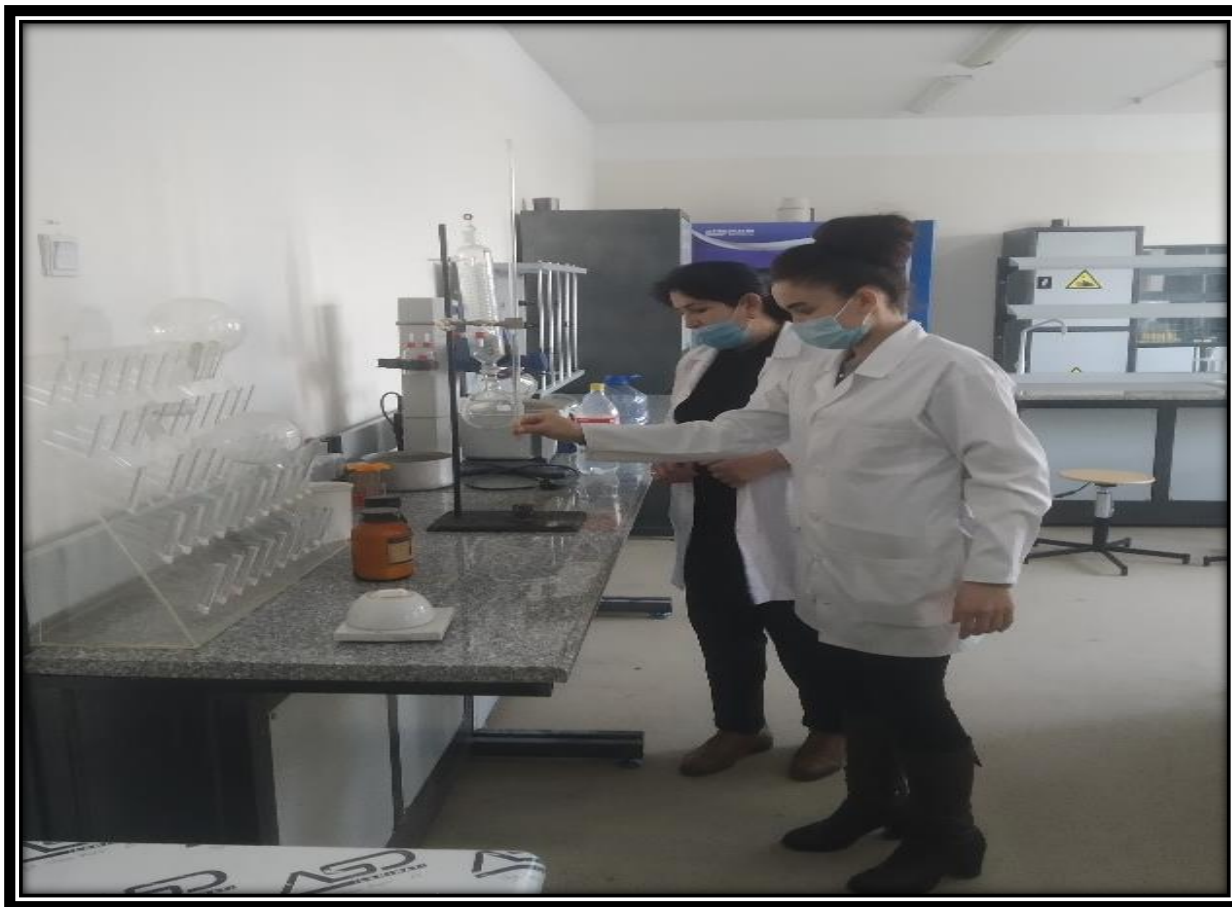
Figure 7. Of water in the chemistry laboratory of our university study of hydrochemical composition

absorption. As a result, the filtered water is added to the groundwater. As a result, groundwater expands and rises to form lakes of various sizes.