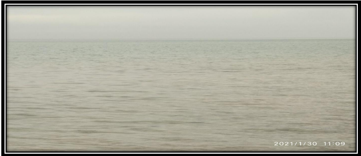
Figure 4. General view of the Todakol Reservoir