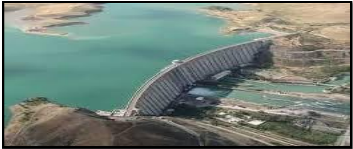
Figure 8. Todakol Dam Reservoir. Prakopt waterworks