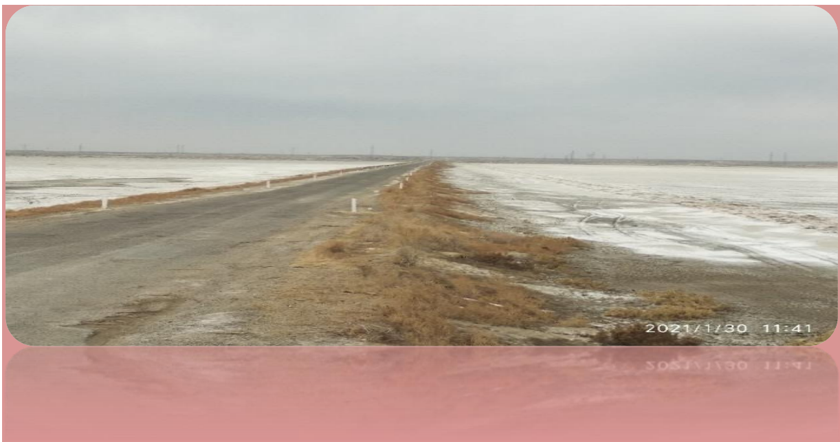
Figure 5. Sandy landscapes

Today, the impact of the reservoir on the environment is growing. New small lakes have sprung up around the Todakol