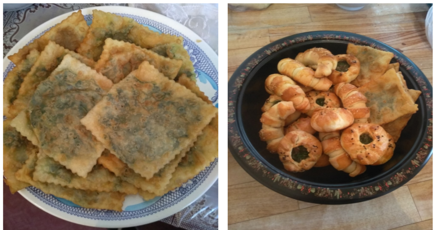
Figure 4. Dishes made from Capsella bursa-pastoris .

stimulant, it is used in daily consumption by the local population. From this plant, the local population also prepares various national dishes in early spring, such as somsa and green dumplings. These dishes are served as the main dish on the holiday table on the day of Navruz. Dishes from this plant are used to increase immunity, strengthen strength, meet the body's need for vitamins and treat various diseases (internal bleeding, diseases of the urinary tract and liver) (Figure 4).