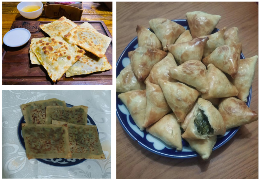
Figure 3. Green dishes from Spinacia turkestanica , Mentha longifolia and Portulaca oleracea .