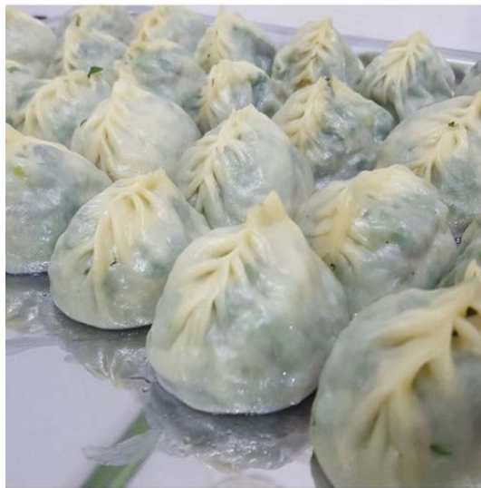
Figure 1. Green manta rays from Portulaca oleracea .

In the Bukhara oasis, species such as Spinacia turkestanica , Mentha longifolia and Portulaca oleracea are widely used as food. Local residents use the leaves of plants such as Atriplex tatarica , Spinacia turkestanica , Chenopodium album and Chenopodium rubrum to prepare various dishes such as somsa, manti, bichak.