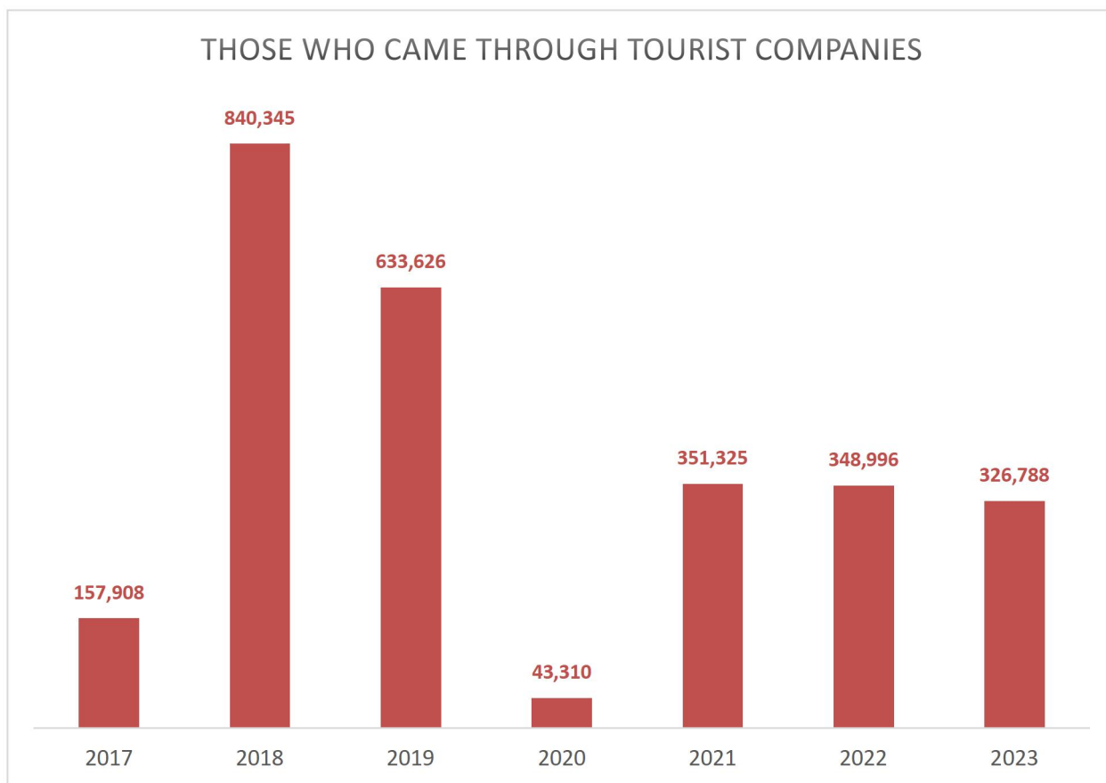
Diagramma-2. Tourist who came from tour companies

Analyzing the diagram, the number of tourists visiting Bukhara through tourist companies is increasing year by year. In 2017, 157,908 tourists, 840,345 tourists in 2018, and 633,626 tourists visited in 2019 through tourist companies. In 2020, during the Global Pandemic, this tourism indicator decreased. In 2020, 43,310 tourists visited Nafat through tourist companies. From 2021, there was another increase and 351,325 tourists visited this year. In 2022, 348,996 tourists and in 2023, 326,788 tourists visited Bukhara through tourism enterprises.