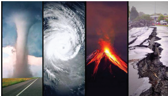
Fig. 1. NATURAL EMERGENCIES. Web site: https://uzspace.uz/ru/area-of-use/view/19 .

Another key principle is promoting healthy lifestyle choices while also encouraging self-care practices such as meditation or yoga which have been proven to reduce stress levels in high pressure environments; this not only helps keep people physically fit but mentally strong too! Finally making sure everyone has access to reliable sources of information about current events so that they stay informed without being overwhelmed by sensationalism from unreliable outlets would be essential for maintaining order within society during any crisis situation - especially one related directly affecting public health & safety concerns like natural disasters etc..