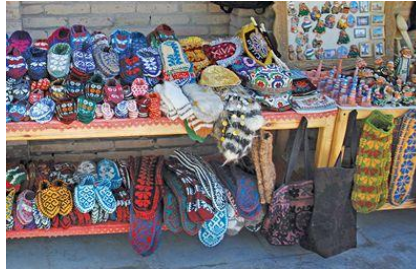
Figure 5. Samarkand