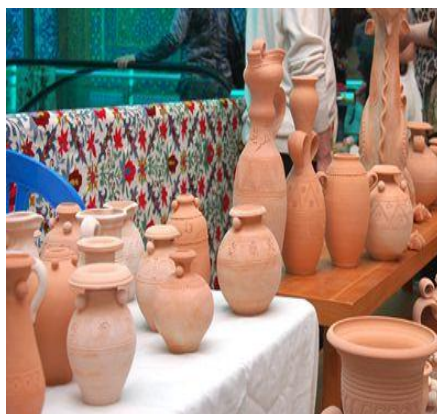
Figures 9, 10

▪ Scissors as a bird; Ceramics (Gijduvan school); Suzani; Silk and wool tapestry; Woodcurving items