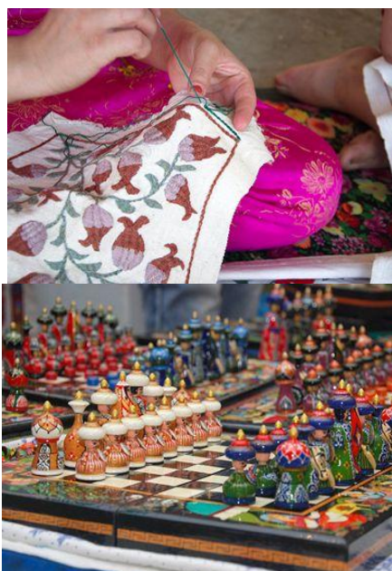
Figures 1, 2, 3

The creations of masters of Ferghana, Samarkand, Bukhara, Khiva and other cities have long been famous far beyond the borders of their homeland and continue to arouse the interest of lovers of beauty from all over the world. Various schools of suzani embroidery and ceramics, skullcaps of various types and purposes, national knives for every occasion, silk and wool carpets, silk and coinage-wonderful works that have been created by the hands of local craftsmen and craftswomen for many centuries make up the unique exoticism of Uzbekistan. Over the centuries, unique centers and schools of folk art crafts have been formed on the territory of Uzbekistan. Each region has its own direction. Chust in Namangan region is widely known for its skullcaps and knives, Ferghana's Rishtan - azure ceramics, ancient Margilan-iridescent Atlas, sacred Bukhara-gold embroidery. The decorative and applied art of Uzbekistan has developed from century to century, leaving a legacy of unique products of famous and nameless masters, striking with the richness of artistic composition [1].