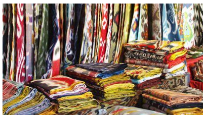
Figure 8. Silk clothes “Adras”; Silk items