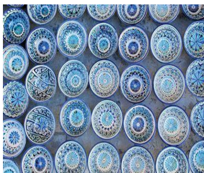
Figure 4. Khiva