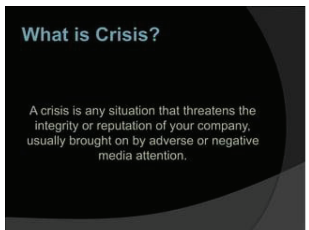
Fig. 2. What is Crisis.

The principles of increasing spirituality and chastity of the population in possible emergency situations are essential elements to ensure a safe and healthy society. In this essay, we will discuss the materials and methods that can be used to increase these qualities among people living in an emergency situation. First, it is important to provide educational resources such as books or lectures on spiritual topics like meditation or mindfulness activities that could help individuals stay connected with their inner self during difficult times. Additionally, providing access to religious leaders who can offer guidance on how best to maintain one's spiritual health would also be beneficial for those struggling with fear or anxiety due to the current crisis (fig. 2.).