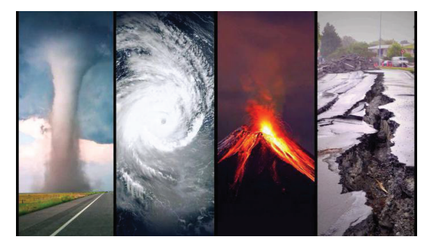
Fig. 1. NATURAL EMERGENCIES. Web site: https://uzspace.uz/ru/area-of-use/view/19.

Another key principle is promoting healthy lifestyle choices while also encouraging self-care practices such as meditation or yoga which have been proven to reduce stress levels in high pressure environments; this not only helps keep people physically fit but mentally strong too! Finally making sure everyone has access to reliable sources of information about current events so that they stay informed without being overwhelmed by sensationalism from unreliable outlets would be essential for maintaining order within society during any crisis situation - especially one related directly affecting public health & safety concerns like natural disasters etc..