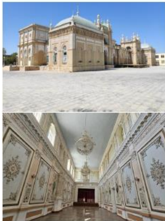
Picture 2 The Palace of the Emir of Bukhara in Kagan city

of tourism in the territory of Uzbekistan". The tourism sector plays an important role in a wide range of activities aimed at finding optimal ways to develop the economy of the Republic of Uzbekistan. Tourism is one of the largest and actively developing sectors of the economy in many countries of the world: the high rate of tourism development, the size of its income has an active impact on various sectors of the economy, which helps the country to form its own tourism industry 5 . By Cabinet Ministry of Uzbekistan it was signed on 28.09.2022 decree under № 543 "On measures to further develop the tourism sector in Bukhara region in 2022-2026 years". According to Resolution of the President of the Republic of Uzbekistan № 245 dated 08.07.2024 year "On measures to realize the economic potential of regions and effectively use vacant land plots" Kagan district was included in the list of cities and districts appendix № 3 Districts and cities where master plans are being developed to create tourist destinations with all the amenities for both domestic and foreign tourists.